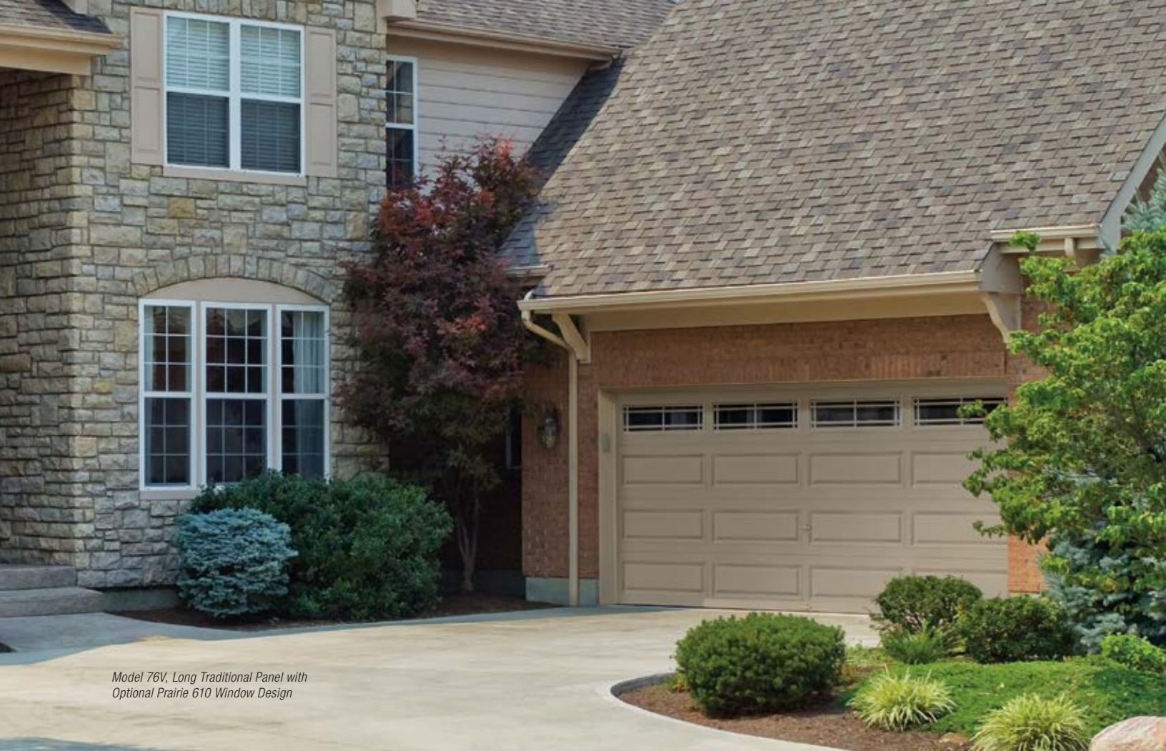
Model 76V, Long Traditional Panel with Optional Prairie 610 Window Design