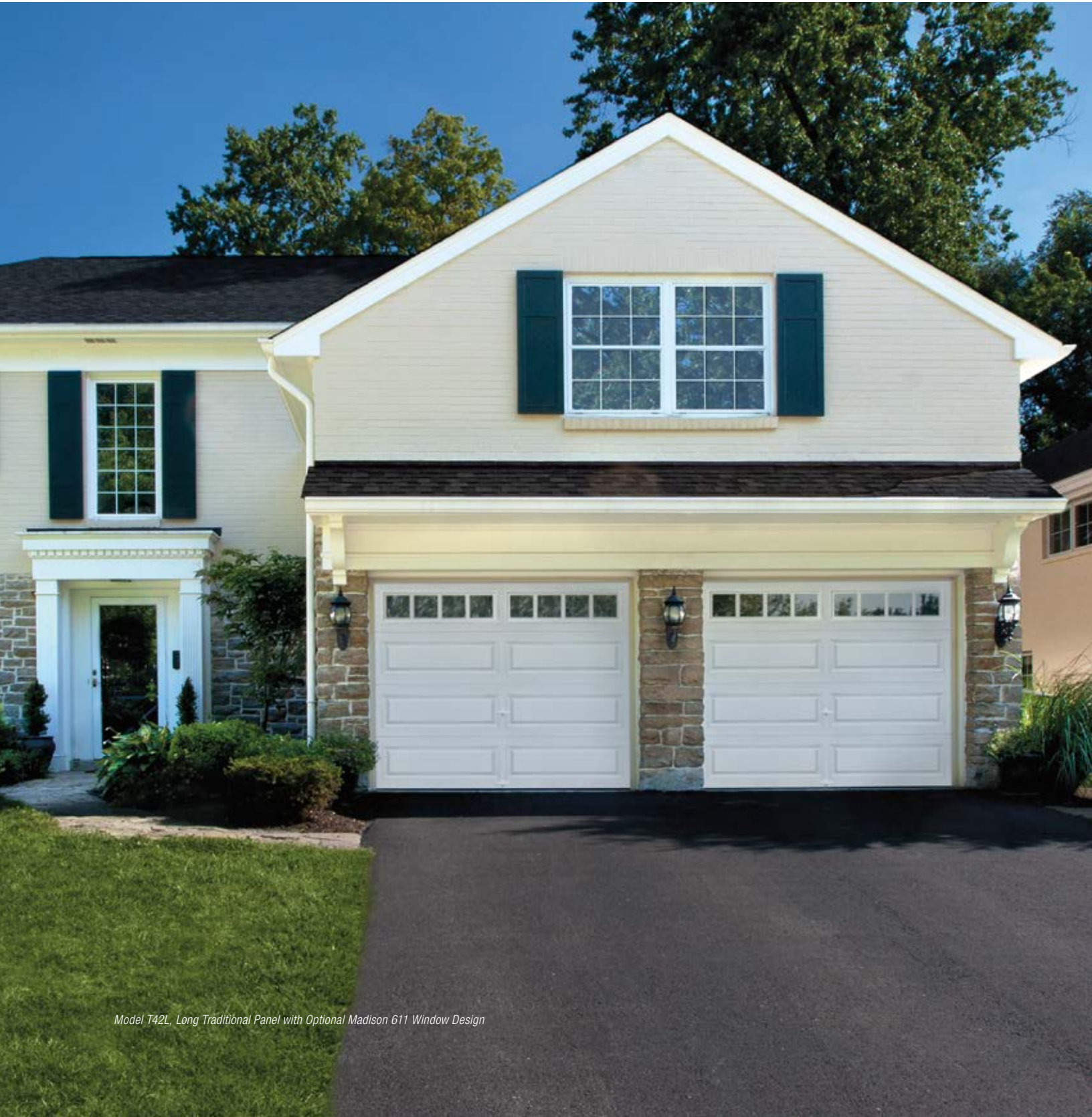
Model T42L, Long Traditional Panel with Optional Madison 611 Window Design