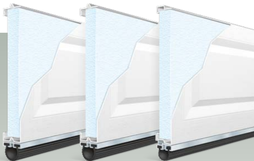
Tongue-and-Groove Section Joints