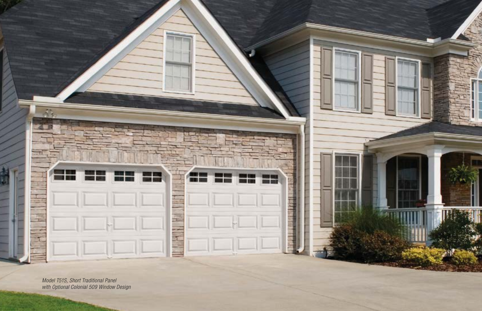
Model T51S, Short Traditional Panel with Optional Colonial 509 Window Design