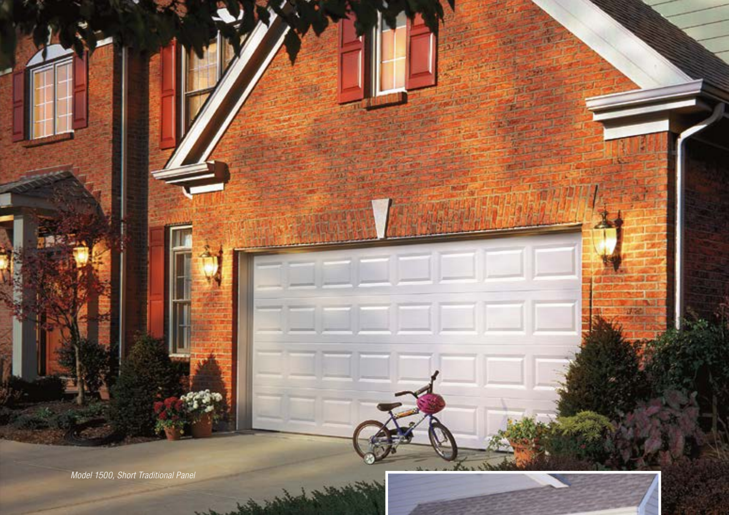
Model 1500, Short Traditional Panel